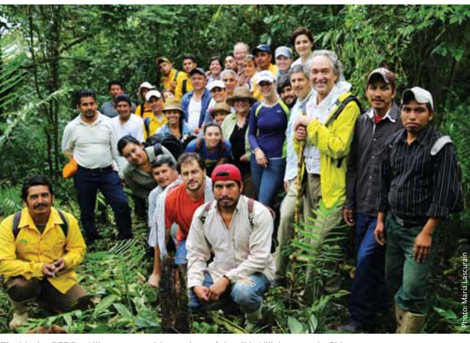
The Mexico REDD+ Alliance team with members of the ejido Villahermosa in Chiapas.

Reducing emissions from deforestation and degradation and the conservation and sustainable management of forests (REDD+) is a mechanism developed within the UN Framework Convention on Climate Change as an option in global efforts to mitigate climate change. In addition to contributing to climate mitigation goals, REDD+ also recognizes the importance of forests for biodiversity and for supporting the livelihoods of many communities worldwide.